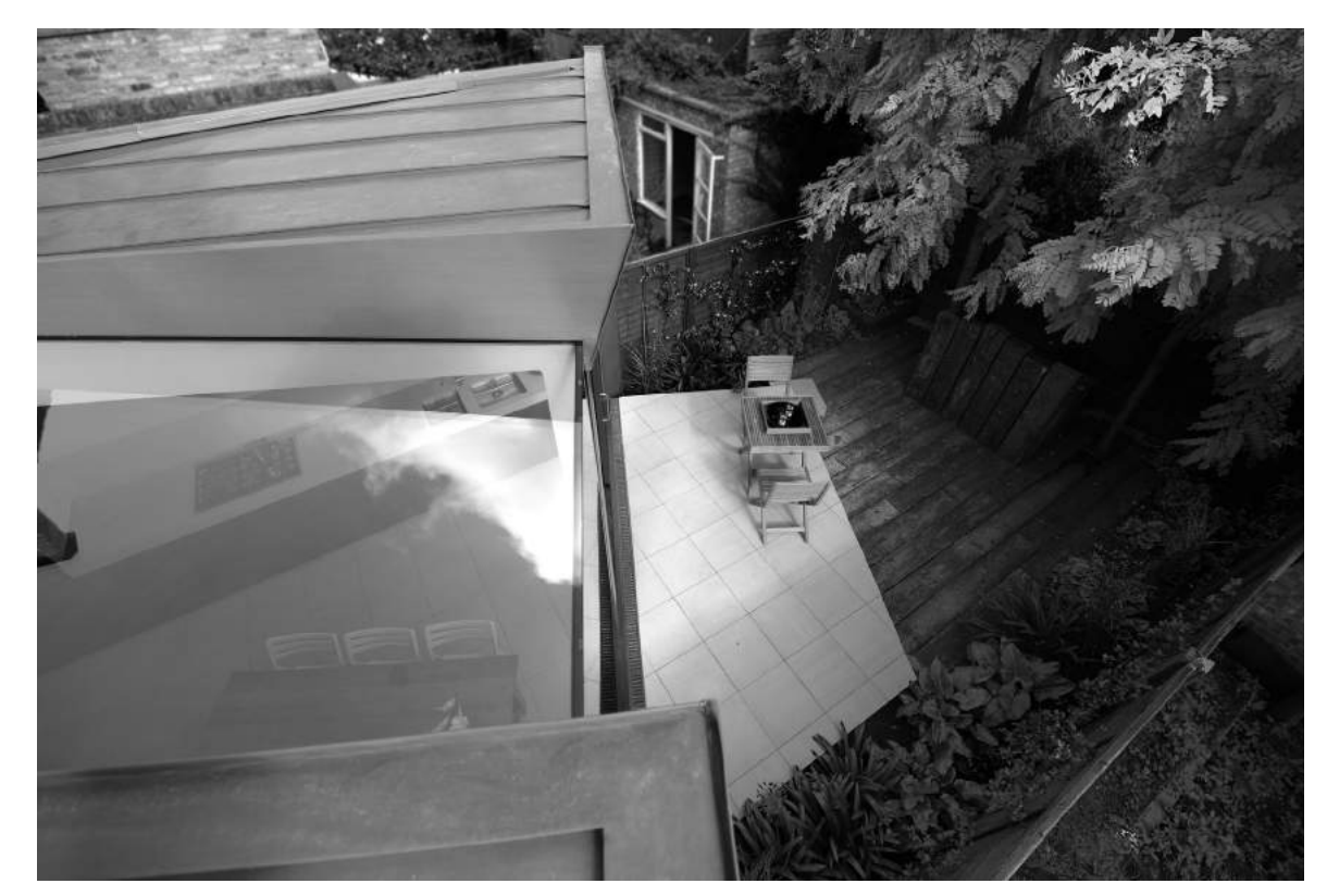
Birds eye view of the 30° faceted angle that allows the overlap between the indoor and outdoor spaces.

Faceted House 1, Alumni Project, Hammersmith, London