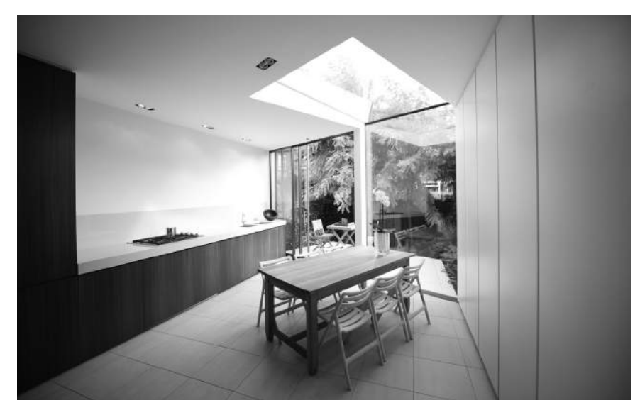
Clutter-free concept kitchen with sliding glass doors and frameless folded roof panel.

Paul McAneary Architects have recently completed Faceted House 1; an Edwardian terrace house located within a conservation area, in Hammersmith, London. The project's brief was to remodel and extend the three-bedroom, two storey house that was in a decrepit state and in need of considerable refurbishment and modernisation. The client asked for a contemporary design and functionality and he also expressed the desire to be able to perceive the garden as a continuation of the domestic space rather than 'the outdoors'.