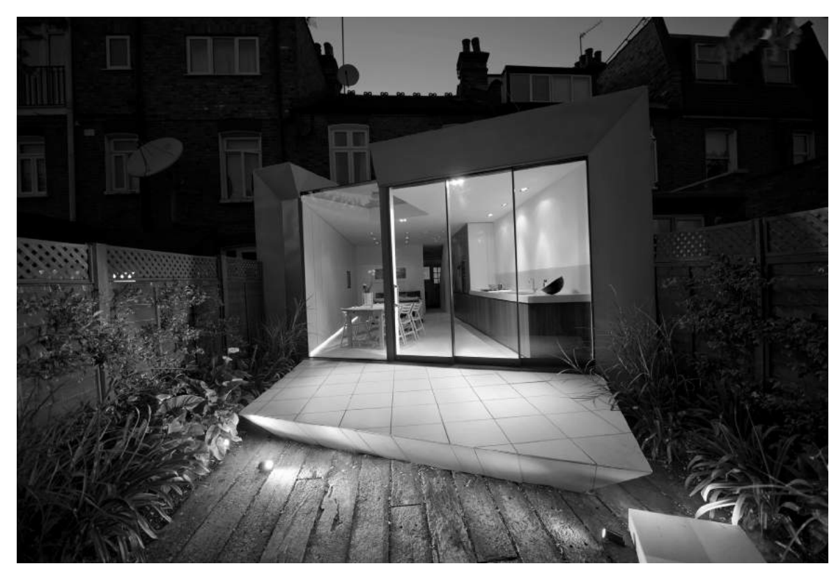
Night view of the sculptural facade and the floating deck. Photos: Paul McAneary Architects Ltd